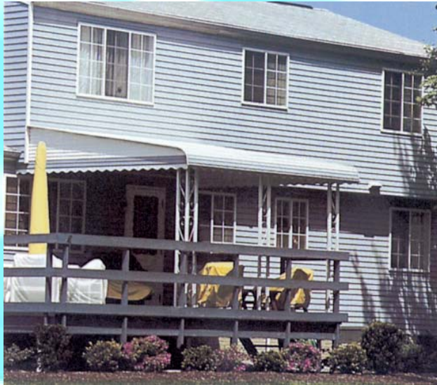
Stepdown Patio Awning

Enjoy your patio or deck to its fullest. No more cancelled cookouts or scorching afternoons. Rain soaked or sun-rotted cushions are a thing of the past. Awnings are the answer. This is truly what weekend life is meant to be.