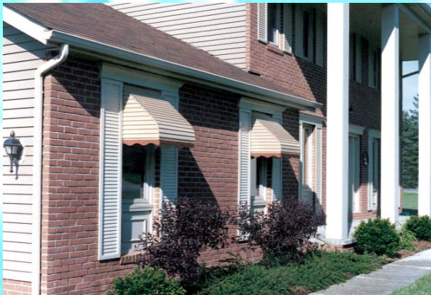
The ideal Window Treatment ..... Aluminum Awnings

Your new Aluminum Awnings will be custom built to exacting standards, and are now available in an entirely new array of contemporary satin finished colors. From Hunter Green to Sierra Clay , you can now compliment your deck furniture and/or house trim. Today's aluminum awnings are designed to be a "soft" blend in accessory for your home.